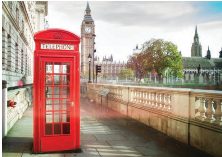
Clockwise from top: Four Seasons Hotel London at Park Lane, local London icons