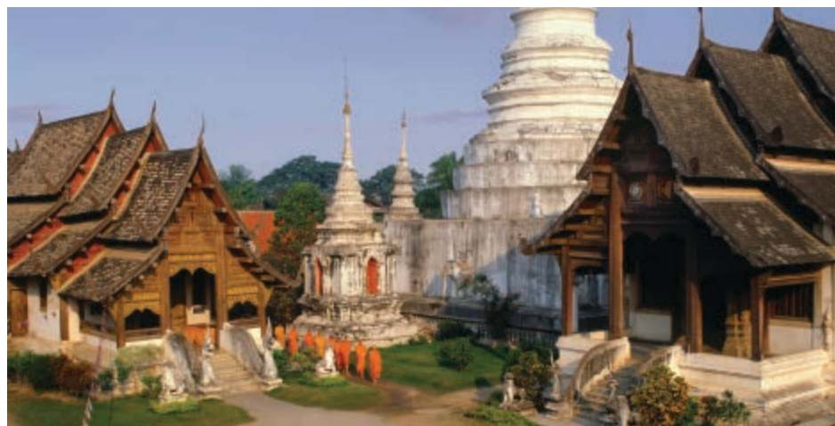
Clockwise from top: Elephant trekking, Four Seasons Resort Chiang Mai, Wat Phra Singh