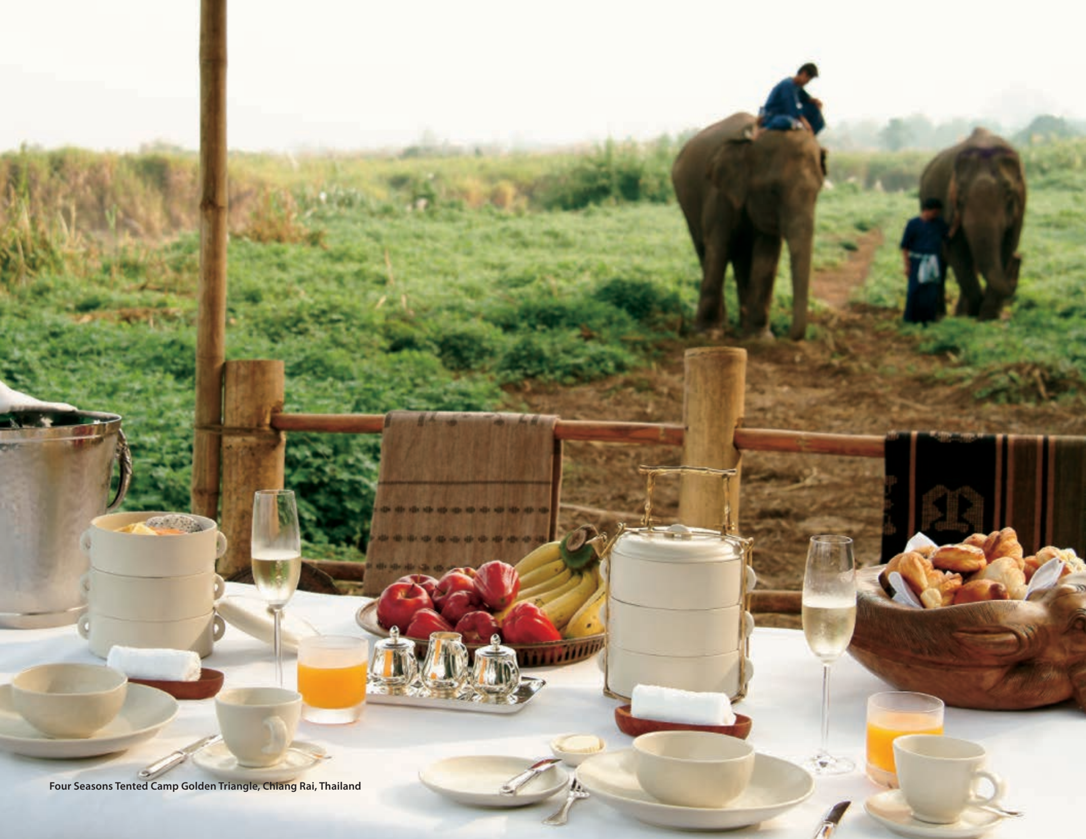
Four Seasons Tented Camp Golden Triangle, Chiang Rai, Thailand