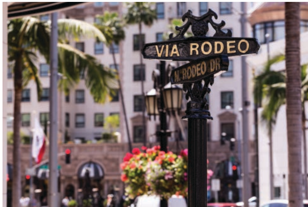
Clockwise from top left: Pool at Beverly Wilshire (A Four Seasons Hotel), hotel lobby, Rodeo Drive