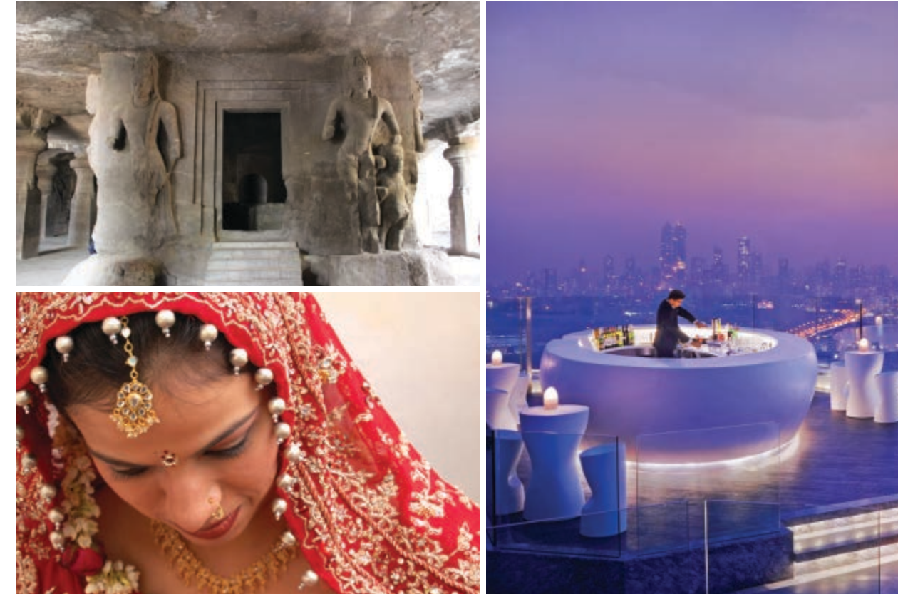
Clockwise from top left: Cave temple at Elephanta Island, Four Seasons Hotel Mumbai, woman in traditional attire Opposite page: Taj Mahal

Visit the majestic Taj Mahal, the legendary white marble mausoleum that took over 22 years, 20,000 people and 1,000 elephants to construct.