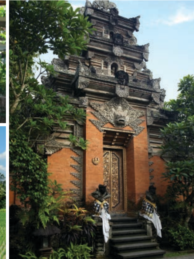
Clockwise from top left: Traditional Balinese dance, temple in Ubud, rice fields Opposite page: Four Seasons Resort Bali at Sayan