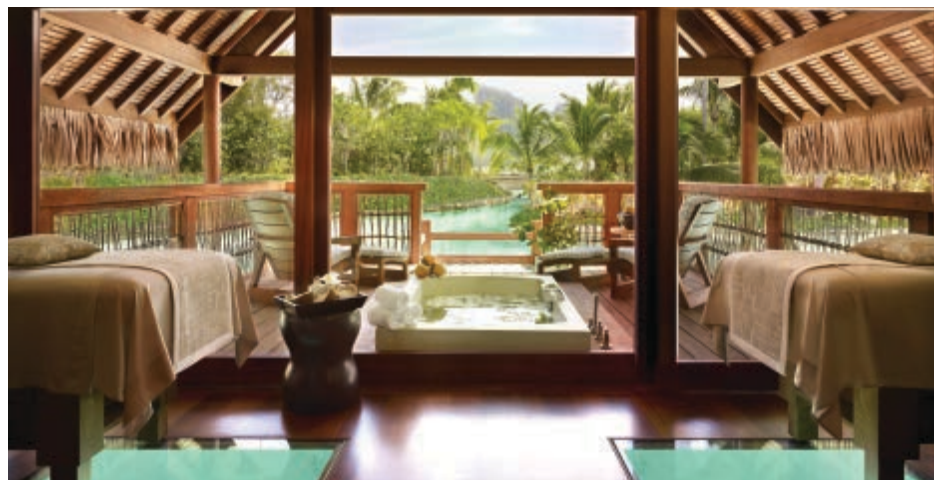
Clockwise from top left: Traditional fire dancers, Four Seasons Resort Bora Bora, Kahaia spa suite