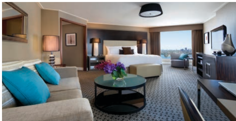
Clockwise from top left: Koala, Sydney Harbour, Four Seasons Hotel Sydney