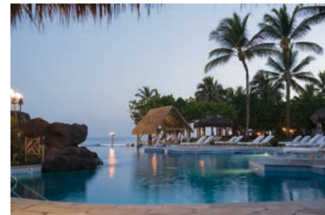
Clockwise from top left: Touring by helicopter, snorkeling, Four Seasons Resort Hualālai at Historic Ka'ūpūlehu pool, and beach (opposite page)