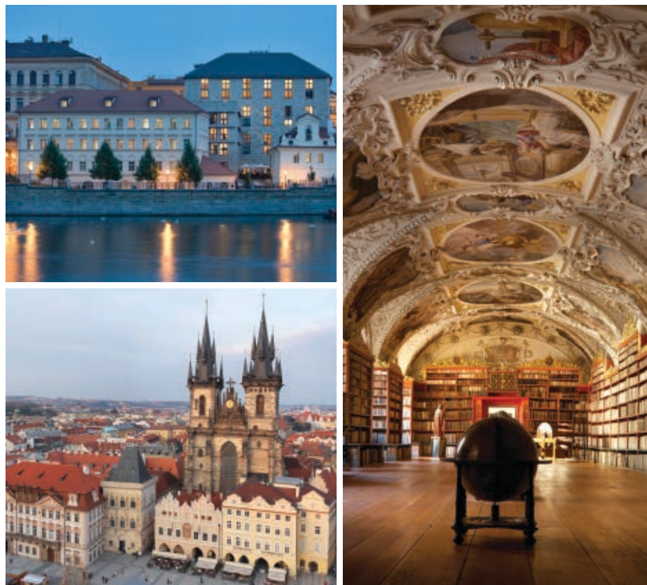
Clockwise from top left: Four Seasons Hotel Prague, Strahov Monastery, Old Town Square Opposite page: Charles Bridge